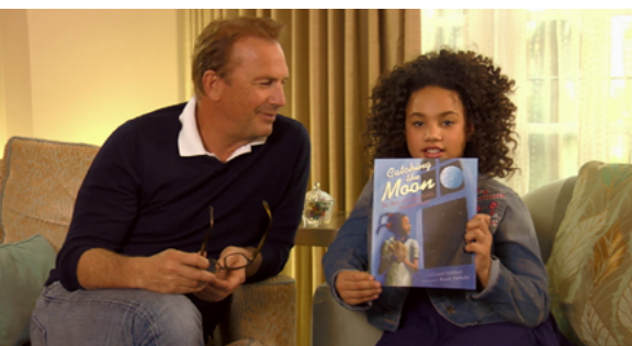
KEVIN COSTNER & JILLIAN ESTELL READ CATCHING THE MOON

Storyline Online® is a free educational resource for children, parents, English language learners and teachers worldwide. The digital library offers a diverse collection of authors, illustrators and topics. Videos are accompanied by activity guides for home and school that include summaries, discussion points and hands-on activities to encourage children to think more deeply about the topic and themes.