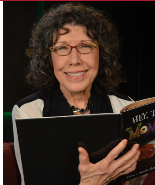
LILY TOMLIN READS HEY, THAT'S MY MONSTER

The SAG-AFTRA Foundation produces an internationally recognized children's literacy resource called Storyline Online® ( storylineonline.net ) which streams interactive videos for children ages pre-K through 5th grade featuring beloved actors reading award-winning children's literature alongside creatively produced original illustrations.