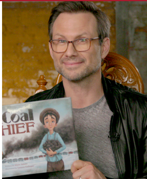
CHRISTIAN SLATER READS THE COAL THIEF