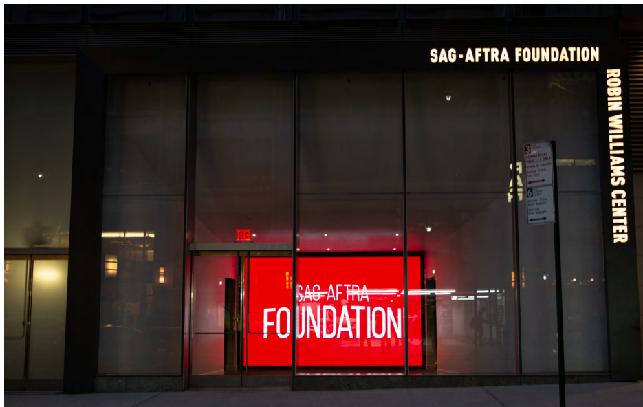
Robin Williams Center for Entertainment and Media Exterior Street View - New York