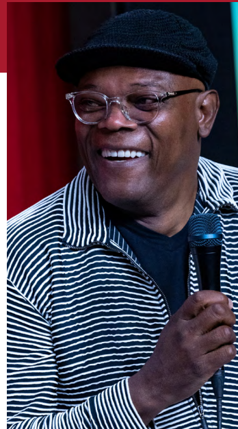
Samuel L. Jackson

For any SAG-AFTRA performer on the Awards campaign trail, participating in Conversations has become a must to generate awareness and buzz among their peers. Award season campaigning, film releases, and show premiers create a constant flow of traffic to our venues throughout the year.