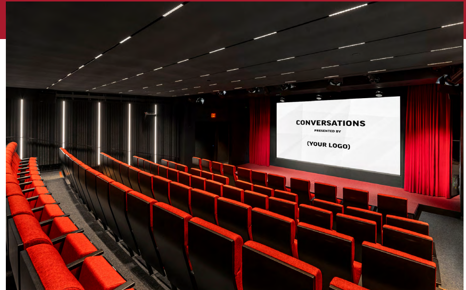
Meryl Streep Center for Performing Artists Tom Hanks & Rita Wilson Screening Room - Los Angeles